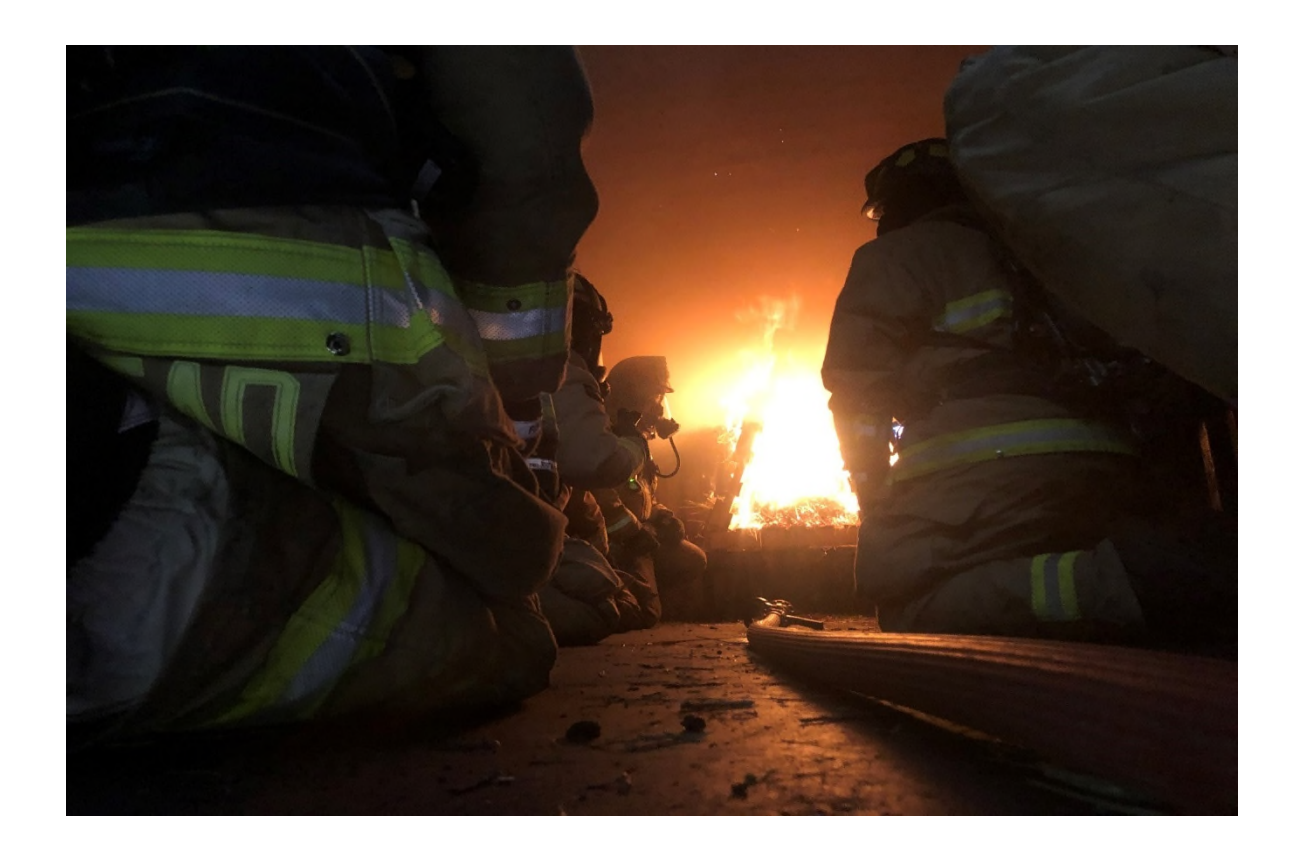
TLTI EMERGENCY SERVICES TRAINING CENTRE 312 Lyndhurst Road Lyndhurst, ON K0E 1N0

• To register for a course complete the <u>application</u> and send to fireadmin@townshipleeds.on.ca