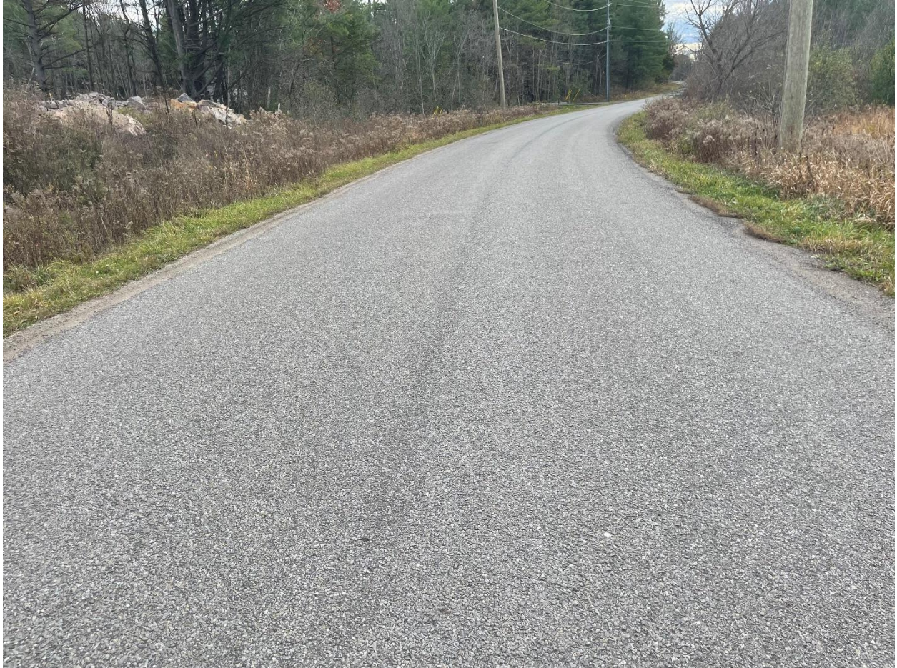
Figure A1 – Pavement Condition of Fitzsimmons Road