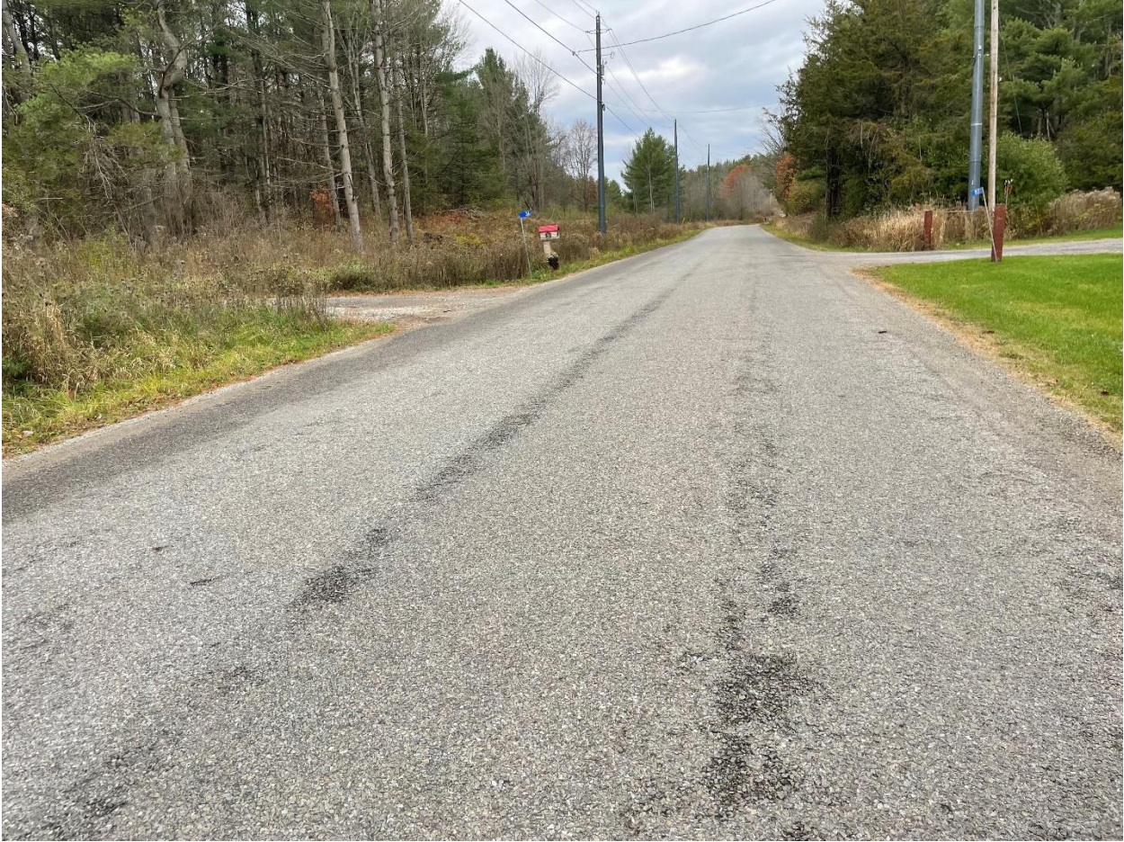
Figure A2 – Pavement Condition of Fitzsimmons Road