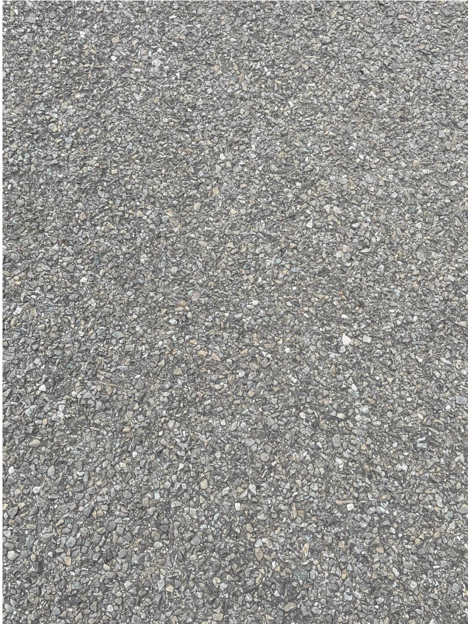
Figure A3 – Pavement Condition of Fitzsimmons Road