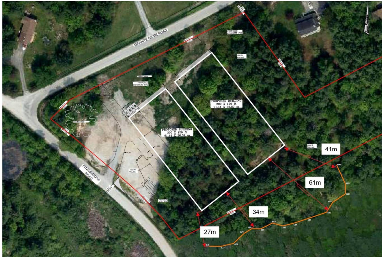
Figure 1. The proposed building locations (outlined in white). The orange line represents the top of slope created by site clearing in 2022. The plan and setback distances from the orange line were provided by Fotenn Inc., the location of the orange line was provided by Ecological Services, as based on GPS reference points gathered on Dec. 5.

This environmental impact assessment was completed at the request of Kelsey Jones (Fotenn Inc. Planner) on behalf of the Pecks Marina for a storage facility (see Figure 1) at the corner of Fitzsimmons Rd. and Granite Ridge Road, north of Ivy Lea Ontario.